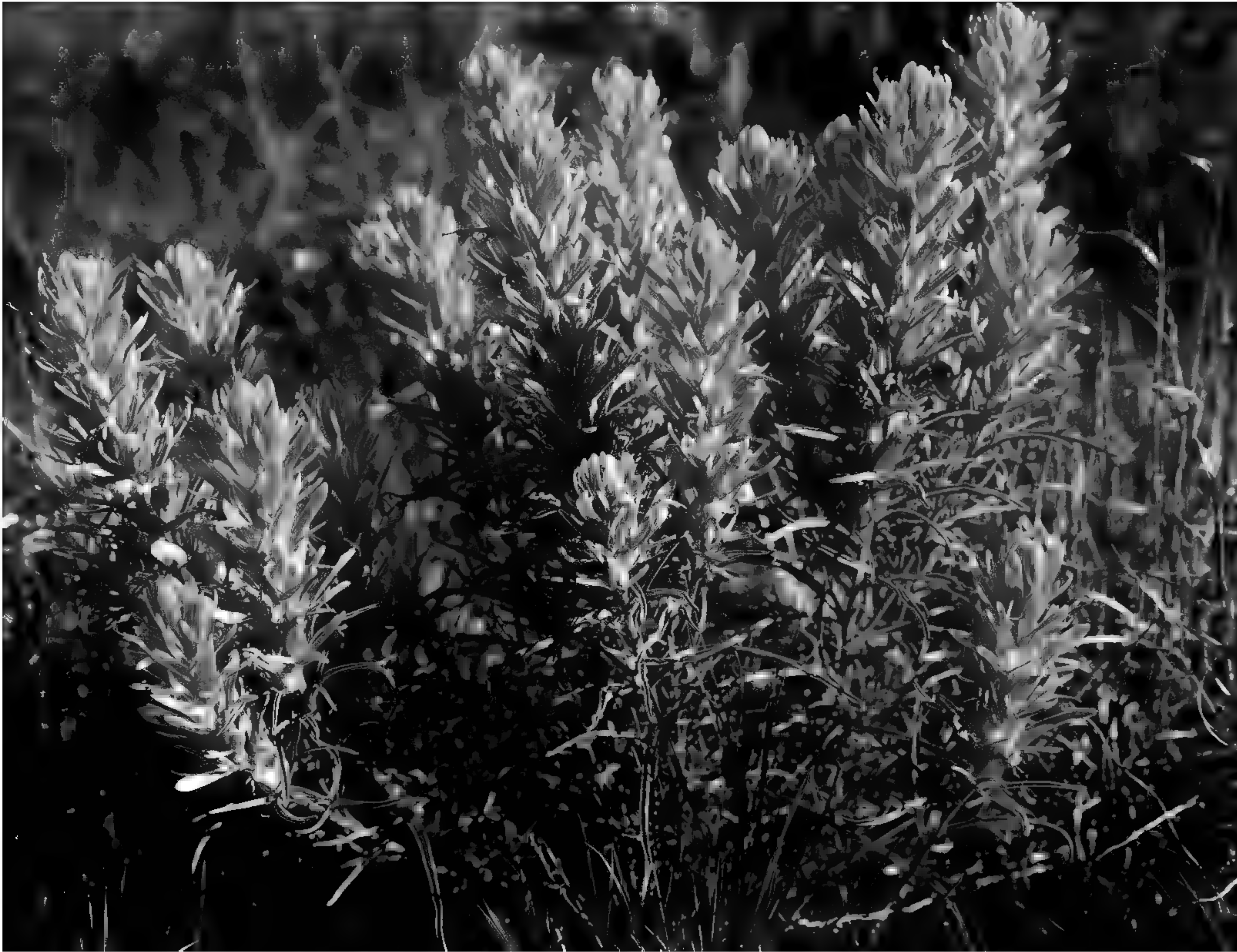
Figure 7. Castilleja citrina in typical form. West of Benoit, Runnels Co., Texas, 20 Apr 1997.